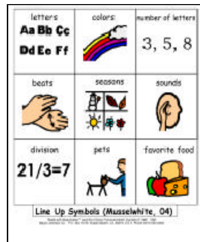
Line-Up Script Symbols