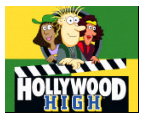
Hollywood High www.nprinc.com/catalog/char-ed/char-dev/hollywood.htm

Hollywood (ages 6-12) and Hollywood High (ages 9-18) are multimedia script writing software programs. Both Hollywood and Hollywood High were developed for general education populations. However, as many authors have pointed out, they can be highly appropropriate for individuals in special education, general education, and gifted programs. Both programs are ideal for supporting struggling writers, especially those using AAC devices for writing.