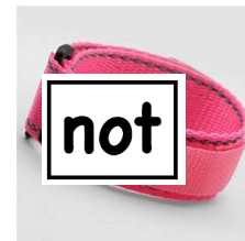
Word on Velcro bracelet