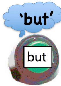
Word + text on device