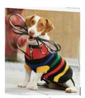
He is so fun.