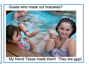
Tools for Story Scripts . Most high-tech AAC systems can easily be modified to create Story Scripts. Here are a few tools that work especially well for creating Story Scripts with images. Note Sadie's Pictello 'weekend stories' across the years.