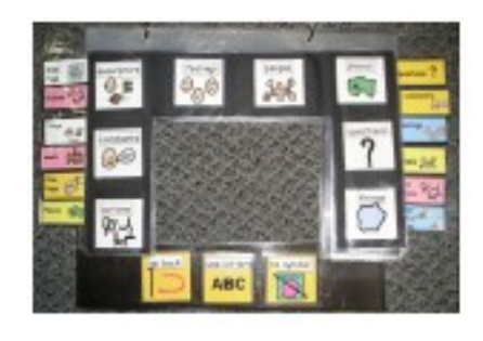
Print 'n Communicate